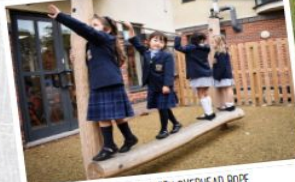
BALANCE BEAM WITH OVERHEAD ROPE