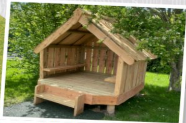
LOOKOUT LODGE - LOCATION TBC