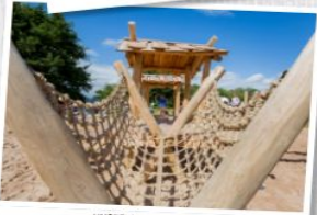
KNOTTED ROPE BRIDGE