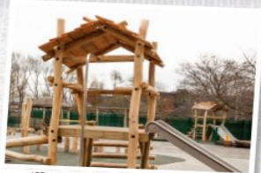
ADD A ROOF TO YOUR SLIDE TOWER FROM E745