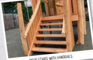
SOLID STAIRS WITH HANDRAILS